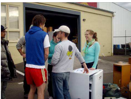
Volunteers organizing house set up in 2008

In April 2009, we expect to receive about 20 Bhutanese refugees in Palmerston North. To prepare volunteers, the next training course will be held at the Red Cross starting 23 rd of March and finishing 4 th April 2009.