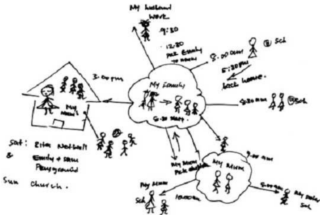
Figure 2 One Chinese-Japanese Family's Current ECE Arrangements