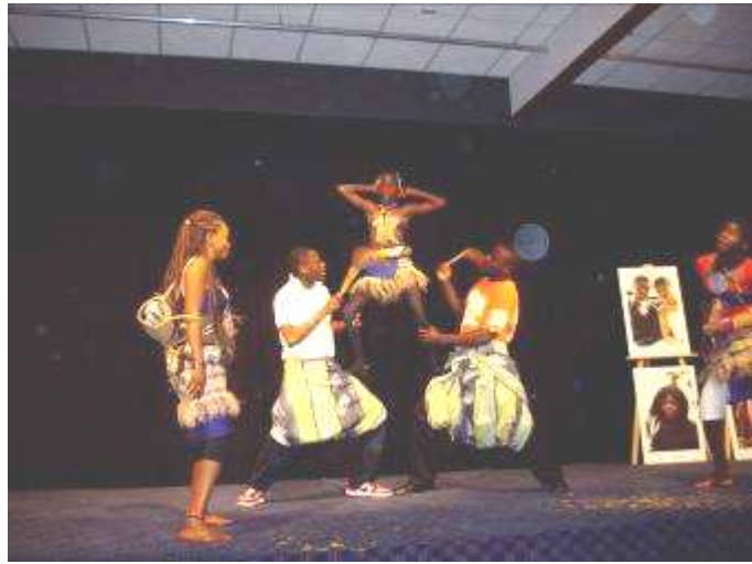
The Congolese community perform a traditional dance

Each community performed either a dance or song and these acts were interspersed with brave and often moving accounts of the personal stories and journeys of individual refugees from each community.